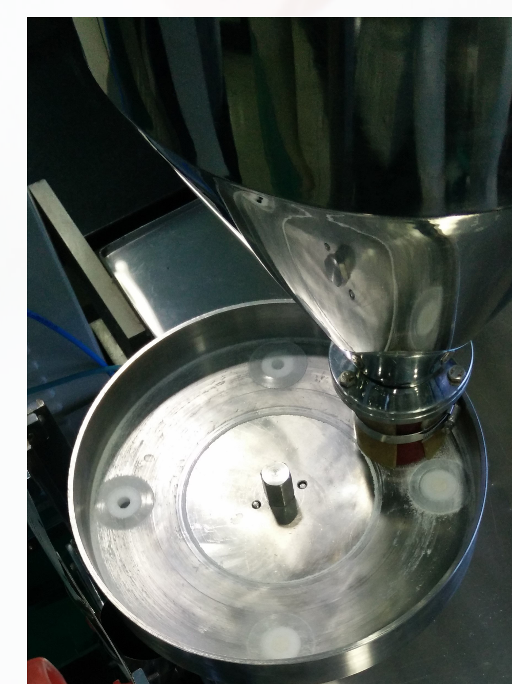
Figure 2. Configuration of Hopper and Die That Control the Stickpack Fill Weight by Gravity Feeding

Hopper (A) contains the powder blend that relies on gravity feeding into four dies at (B). (C) The blend in each die is dropped into a small cone shaped hopper and flows into the empty stickpack sachet. At (D) Each stickpack is sealed vertically at 180°C. At (E) each stick pack is further sealed horizontally at 80°C and cut into the final stickpack.