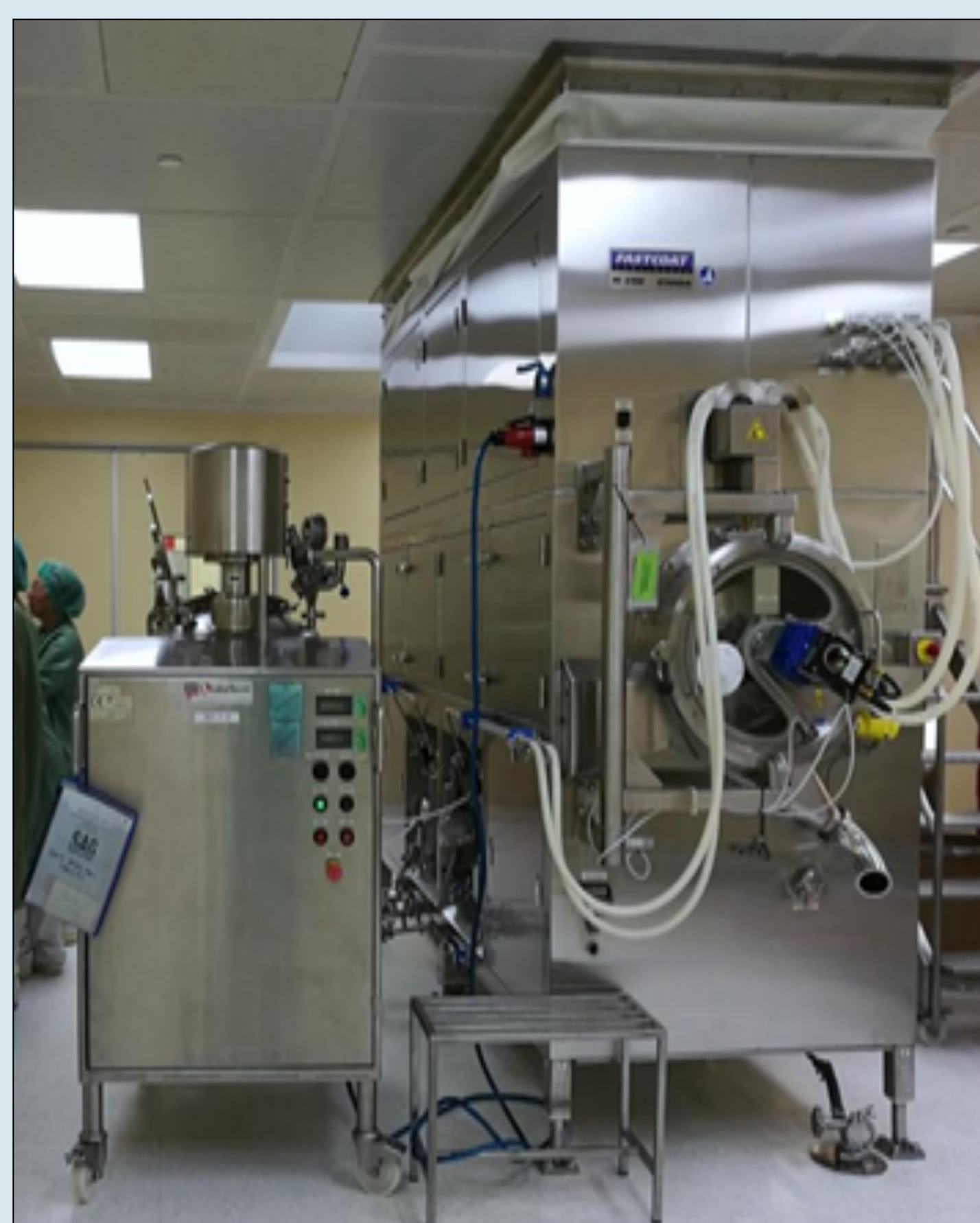
Figure No.1. Continuous Coating Pan (O'Hara Technologies Inc.)

Two trials were conducted in an O'Hara Fastcoat, Continuous Tablet Coater (Model: FC C500) fully perforated pan (Figure No. 1), equipped with 14 spray guns (Schlick Gun) at SAG Manufacturing, Madrid (Spain). Tablets were fed continuously onto a weigh belt from an over bulk hopper after the completion of initial coating in batch mode. After moving through the spray zone where the desired amount of coating was applied, tablets were then discharged. During the feeding of fresh tablets, zones 1 and 2 were filled with uncoated tablets, which were coated subsequently as they moved towards the discharge zone. The resident load in the coater was approximately 430 kg during the continuous coating process. The process was controlled to maintain coating temperatures and other conditions similar to those used in a typical (non-continuous) batch coater. Once the entire batch was completed, the tablet feed was stopped and exit and inlet gates closed. Coated tablets were discharged from the other side of the coating pan after achieving the desired 2.5% average weight gain.