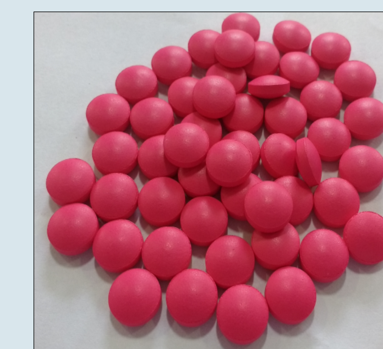
Fig.No.1 Coated tablet with Talc Formulation Fig.No.2 Coated tablet with Capric Glycerides Formulation)